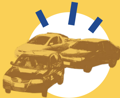
fewer cars on the road