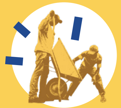
fewer construction and maintenance costs for car infrastructure